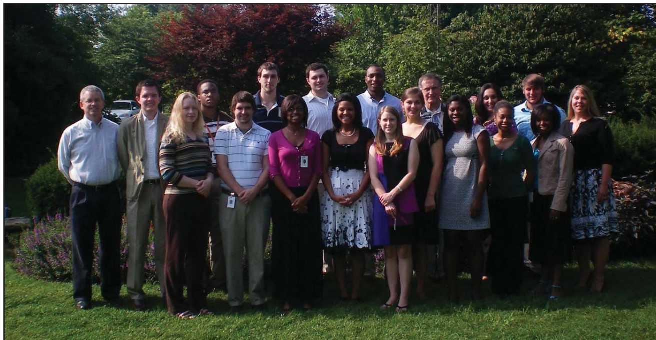
HCA club members and college students participated in the Youth Development Program.